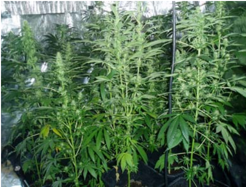
Marijuana Grow Operation

On April 24, 2009 the Elkhart Lake Police Department received a phone call reporting a marijuana growing operation in Apartment 2, 94 West Rhine Street.